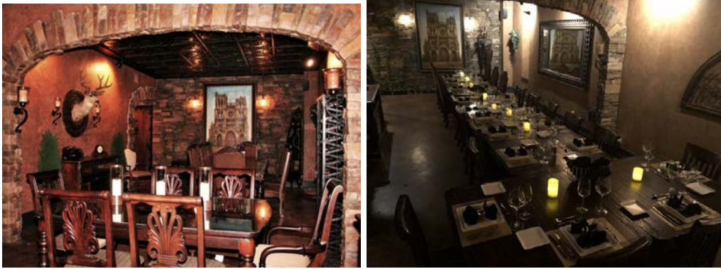
Room 2 (seats 24)